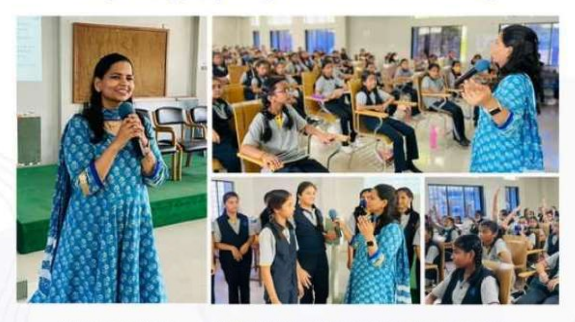
Discuss puberty — and the feelings that come with its changes. Join us for the seminar on Puberty- To celebrate the new change!

"It's probably just puberty." New emotions New feelings.