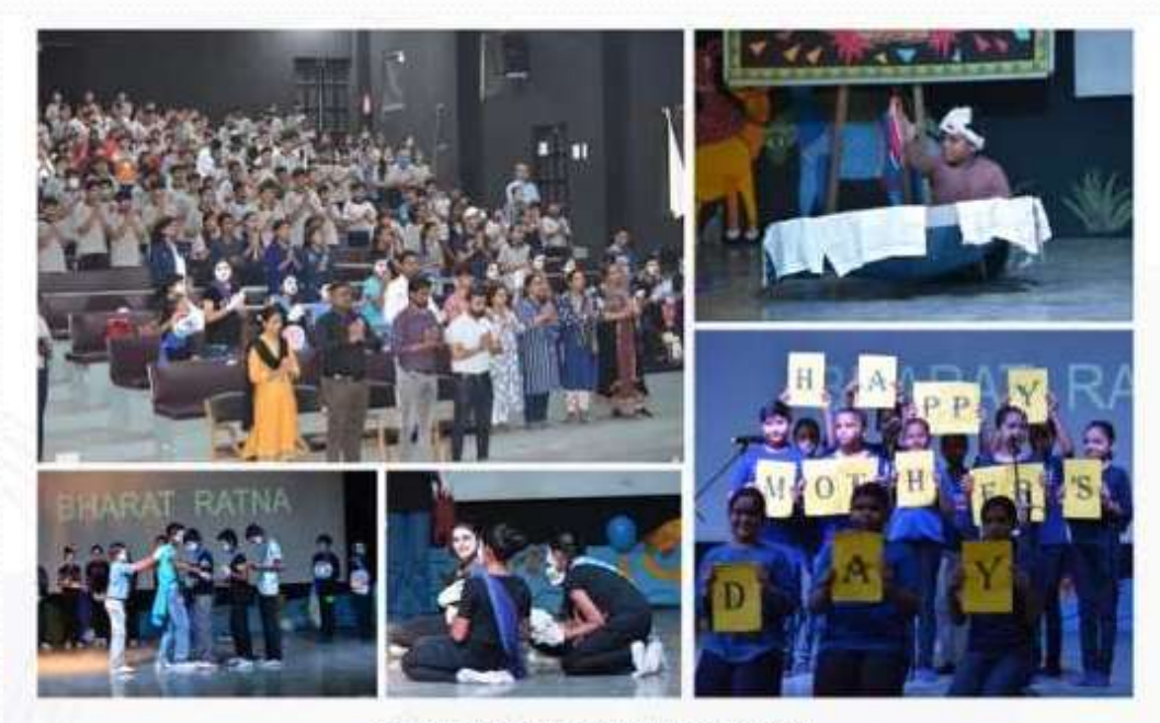
'Making Memories that will Last Forever'

It's a wrap up for the students of Grade 6 to 12 while the summer break begins. A day filled with zeol and enthusiasm marked at LIS.